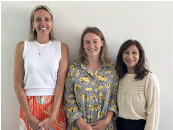
Spring Clothing Sort at Riverside Church in June.