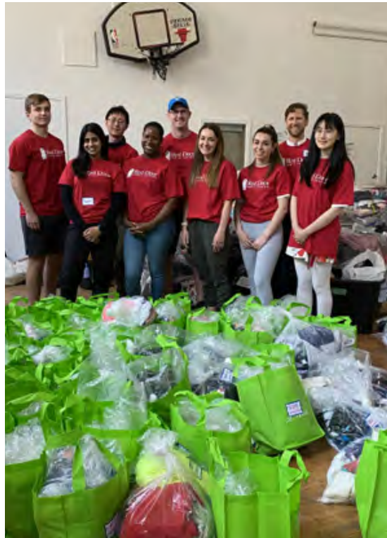
Corporate Volunteer Team Ewing Morris organizing clothes for each shelter family on the final day of the sort.